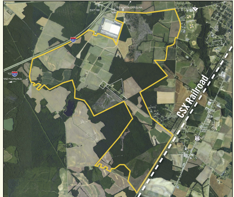
Overhead Aerial View – The Carolinas I-95 Mega Site